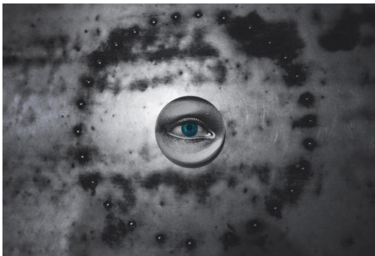
Radiance | 2018 | installation pigment print on canvas | 60 cm x 45 cm