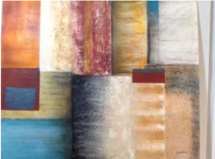
Chromatisme | 2018 | Fatty Pastel | Natural Earth on Canvas Board | Size: 60 x 50 cm