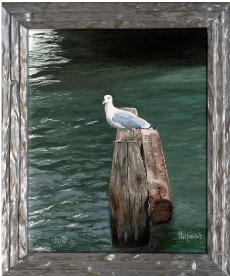
Seagull | February 2018 | acrylic | 35 X 30 cm