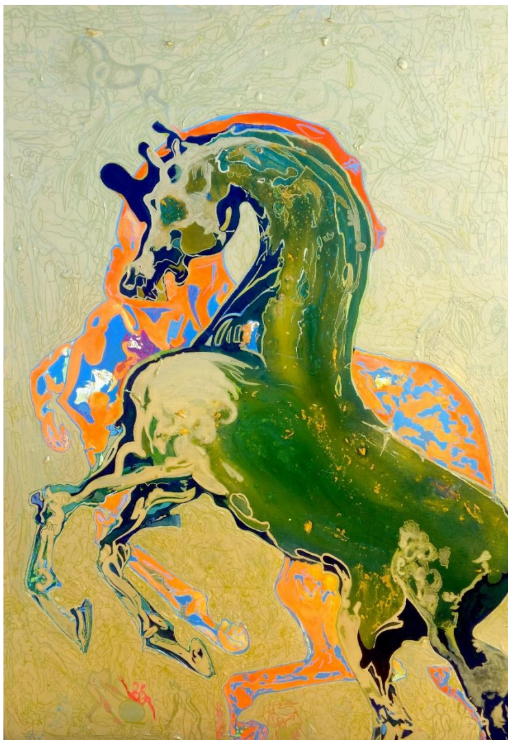
Samsara | 2016 | mixed media on canvas | 100 cm x 70 cm