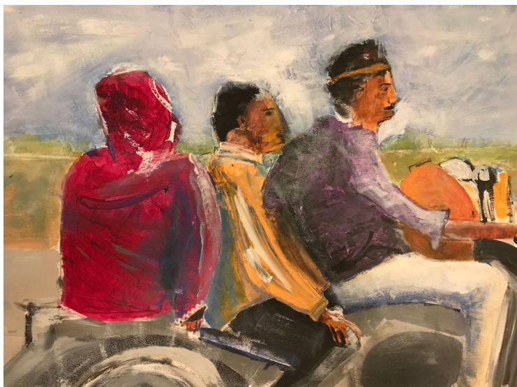
Moving 1 | February 2018 | acrylics on paper | 54 x 37 cm