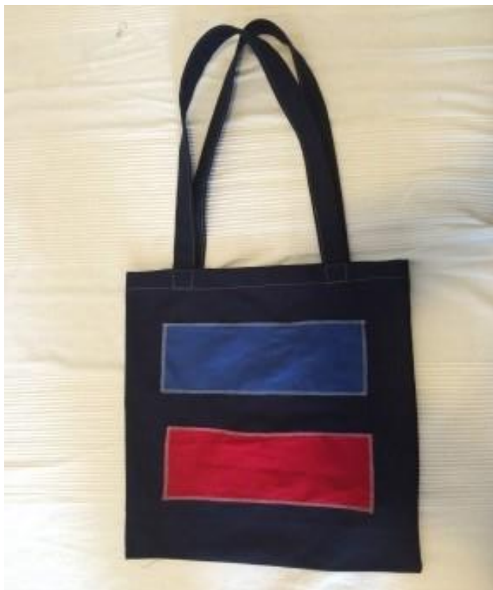
Blue-red bag | 2017 | cotton | 35 x 40 cm