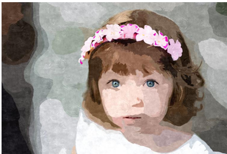
EYE see you | 2018 | oil on canvas | 40 x 50 cm