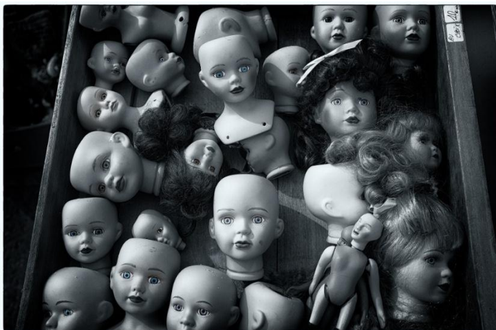
Farsighted | 2018 | interactive installation, Fine Art pigment print on canvas, steel, brass, gold | ca. 65 cm x 55 cm