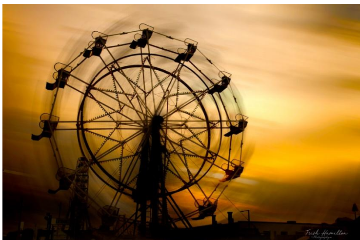
Ferris Wheel | 2012 | acrylic print | 20 x 30 cm