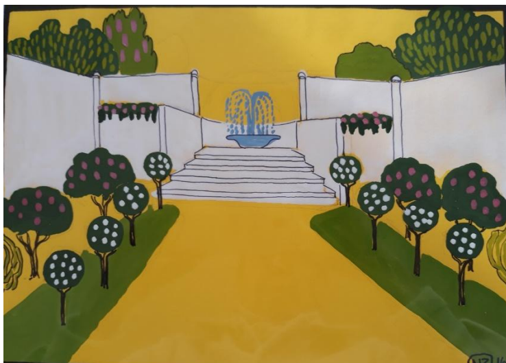
Garden | spring 2016 | gouache | 40 cm x 30 cm