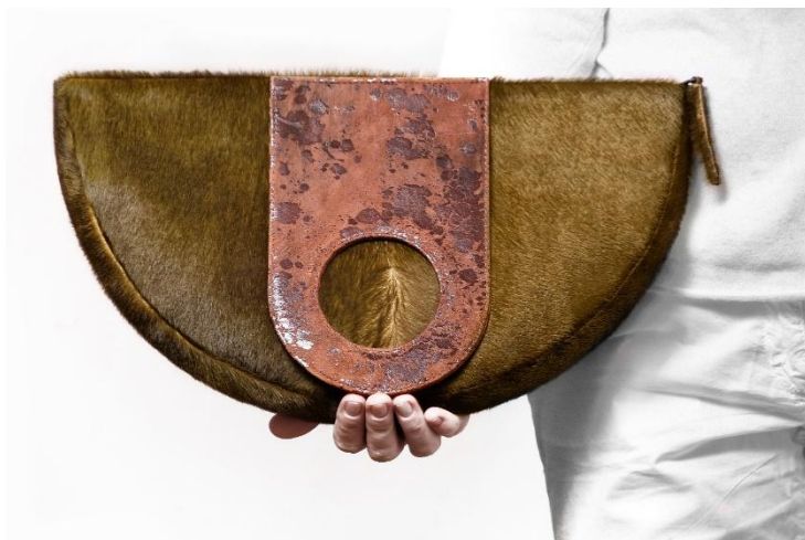
DELETI handbags | winter 2014 | calf skin | 30 x 40 cm