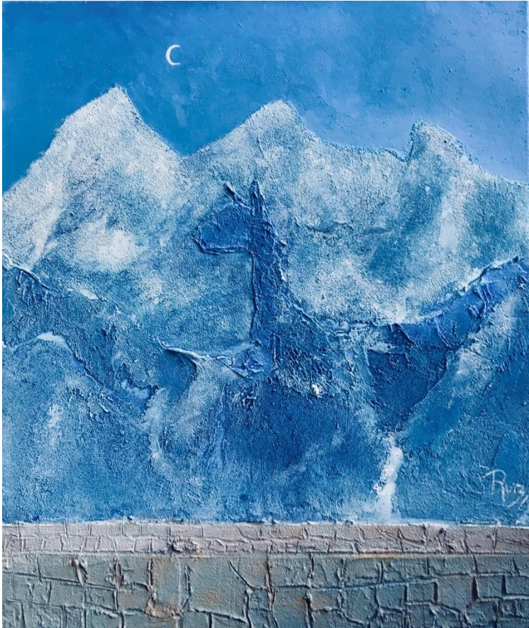
The Andes through Magritte's eyes | 2017 | acrylic on canvas | 50 x 60 cm