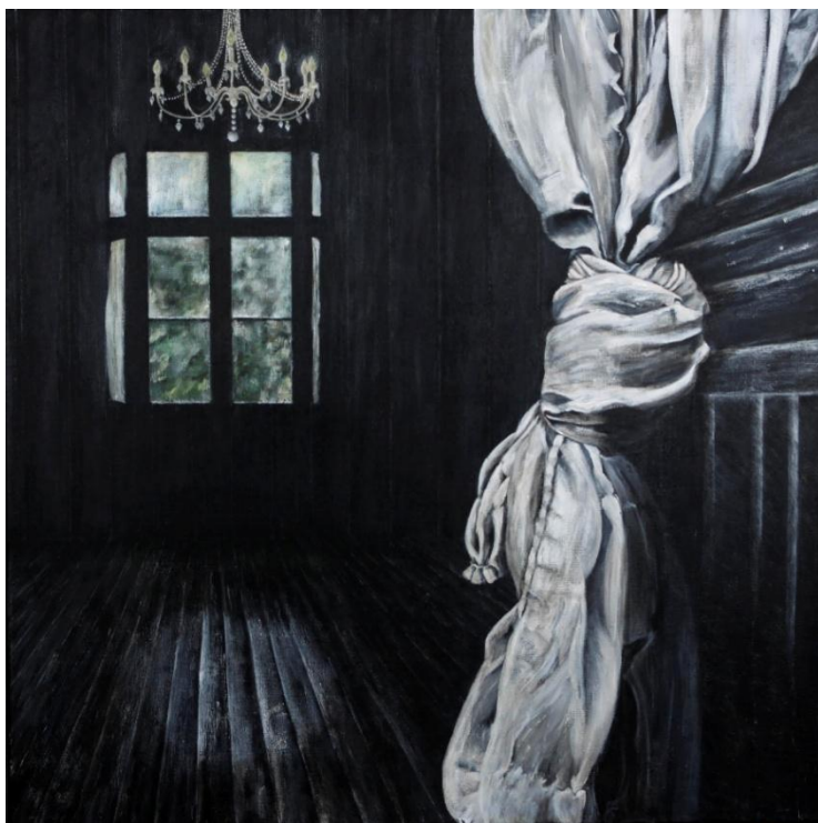
Le depart | 2018 | acrylic on canvas | 80 x 80 cm