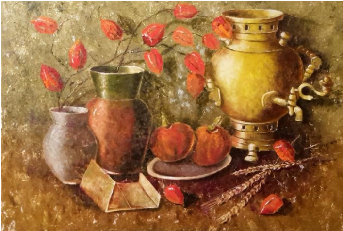
Still Life | September 2017 | oil on canvas | 70 cm x 50 cm