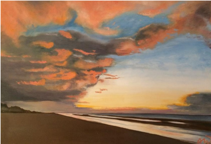
North Sea | 2017 | painting, oil on canvas | 120 x 80 cm