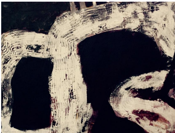
White trace | 2015 | acrylic on canvas | 60 x 80 cm