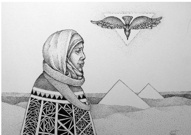
Heaven and Mother Earth | 2016 | ink on paper Dessin A4 Cadre | 50 cm x 40 cm